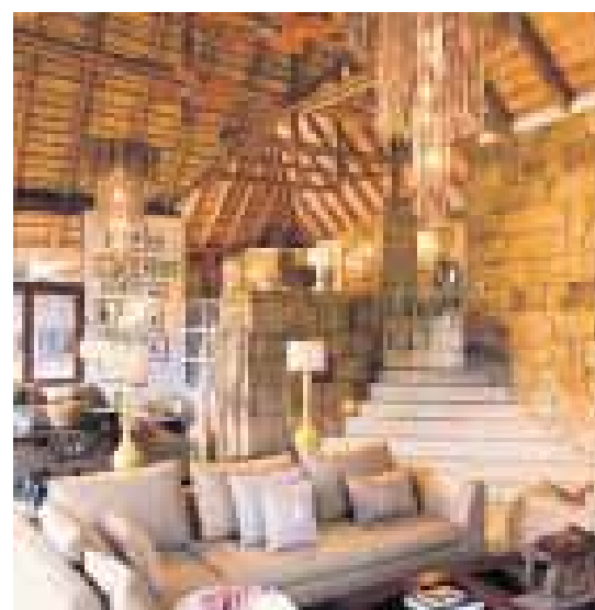
Track leopards at the Phinda reserve, in South Africa, where luxury eco-lodges start at £3.8m