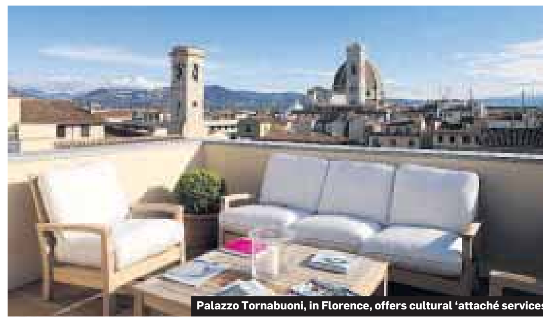
Palazzo Tornabuoni, in Florence, offers cultural 'attaché services'