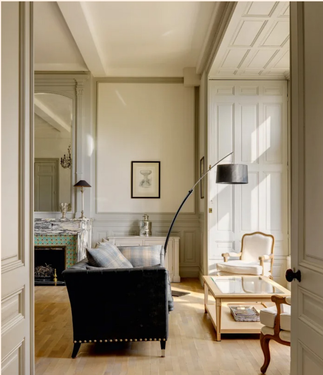
Château Les Carrasses furniture, POA, domainelife.com